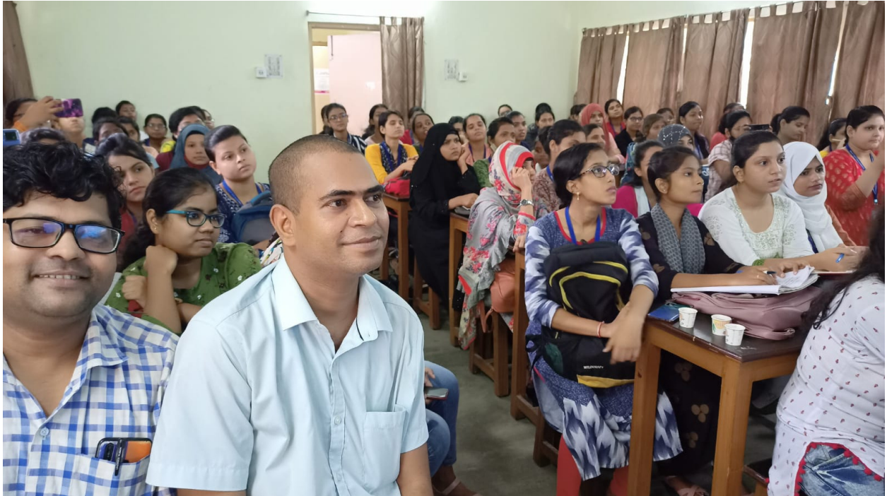
Program on Job opportunities in IT Sector