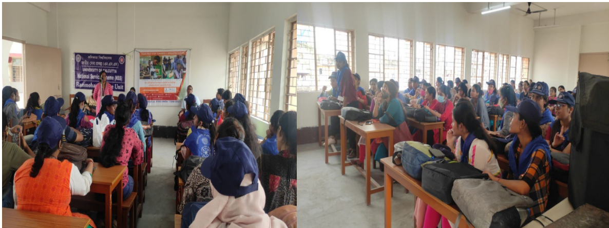
Training program by ICICI foundation

Report: On 26 th March, 2022, a career counseling programme was organized at 11.45 am at New Science Building of Rammohan College. Total 45 NSS volunteers, 4 teachers and students from different streams attended the programme. In this programme the ICICI foundation offered a training programme which is completely free of cost to the students. This training will help the students to get a job in different sectors.