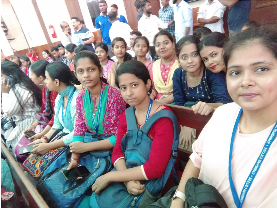
Seminar on Introduction to IT course by VVM Tech