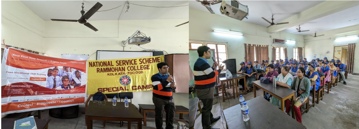
Training Program BY ICICI Foundation

Brief description: On 19 th December, 2022, a career counseling programme was organized at 10.30 am at New Science Building of Rammohan College. Total 48 NSS volunteers, 5 teachers and students from different streams attended the programme. In this programme the ICICI foundation offered a training programme which is completely free of cost to the students. This training will help the students to get a job in different sectors.