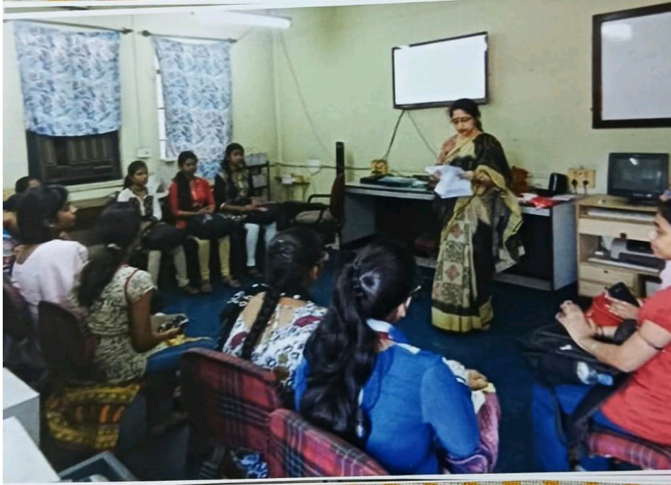
Career Counseling Program