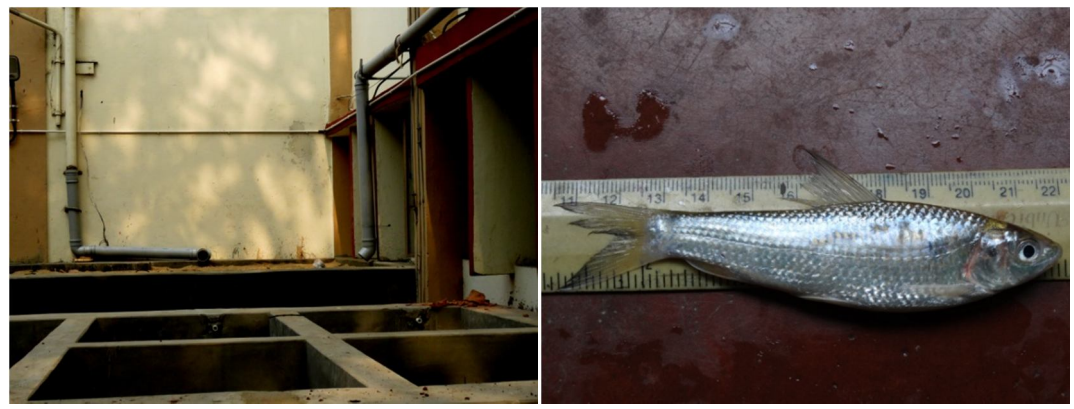
Rain Water Harvest System & Fish Tank

Inductively coupled plasma (ICP) mass spectrometry (MS) finds frequent application in a wide range of research domains, including the food, material, chemical, semiconductor, and nuclear industries, as well as the earth, environmental, biological, and forensic sciences. All kinds of samples and matrices introduced by a range of specialised equipment find a suitable atomizer and element ioniser in the high ion density and high temperature of a plasma. Prominent characteristics include maximum sensitivity (ppt–ppq), relative salt resistance, element response independent of compound, and optimal quantitation precision contribute to ICP MS's unrivalled ability to effectively detect, identify, and consistently quantify trace elements. The molecular identification capabilities of ICP MS hyphenated to species-specific separation techniques are expanded by the growing availability of pertinent reference compounds and good separation selectivity. ICP MS is a productive and extremely sensitive technique for target-element oriented discoveries of relevant and unknown compounds, whereas molecular ion source MS is specialised in figuring out the structure of unknown molecules.