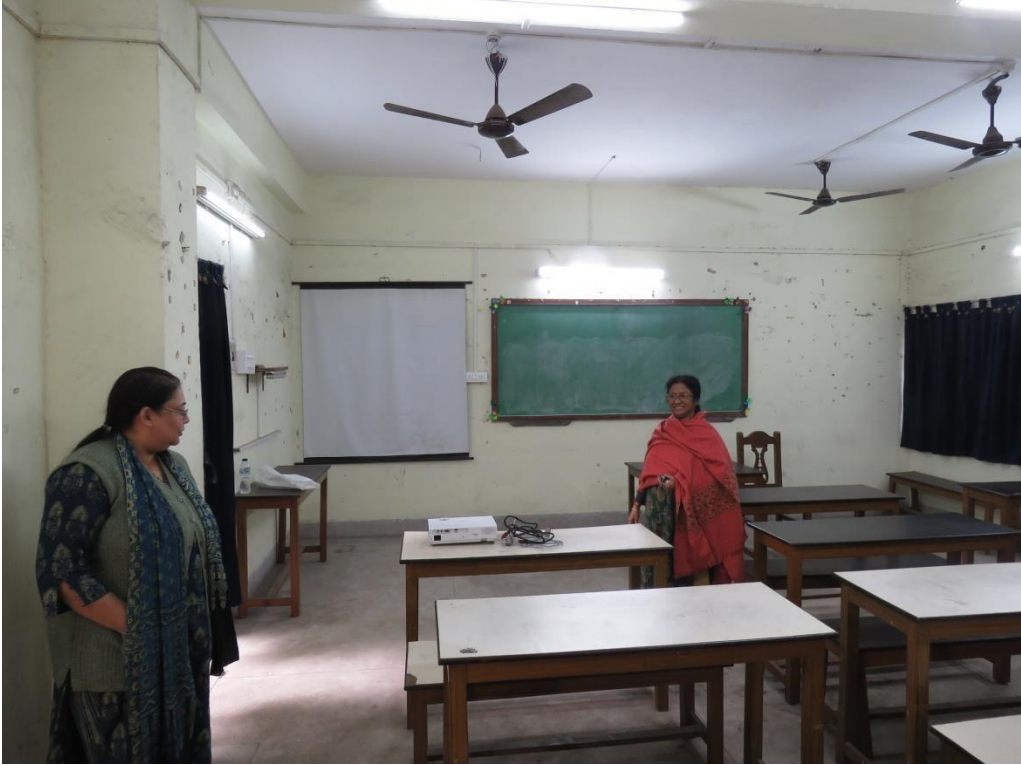
Portable Projector in Botany Department