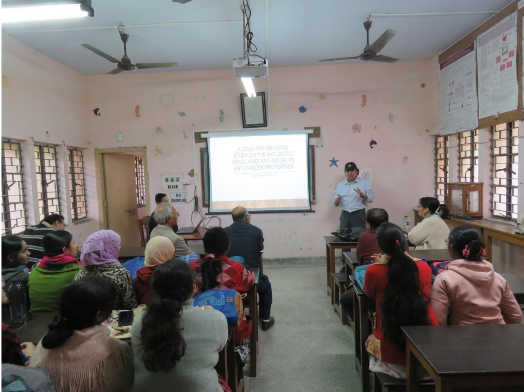
Ceiling Mount Fixed Projector in Zoology