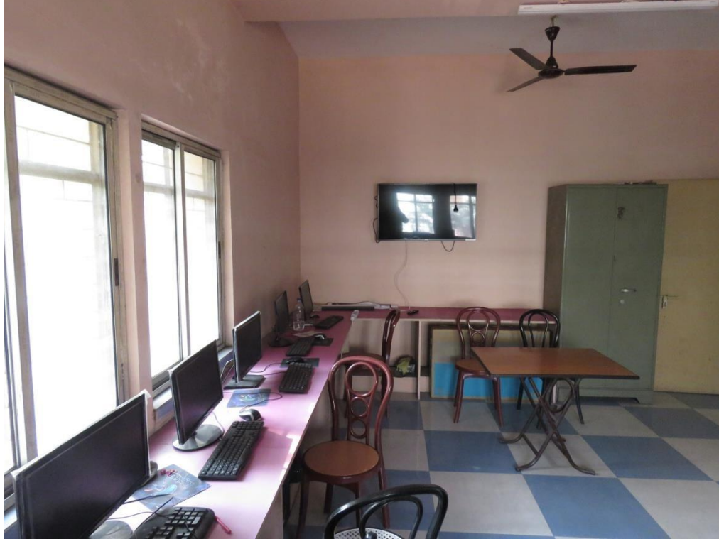
LED TV in Commerce Department