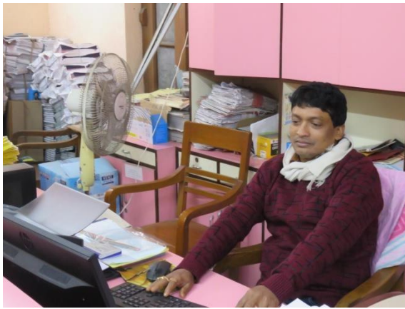
Student Support Cell