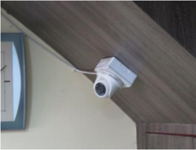
CCTV in Accounts