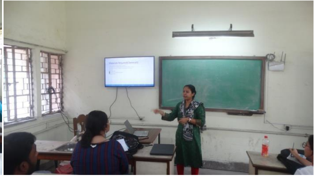
Department of Zoology (Laboratory with LED TV)