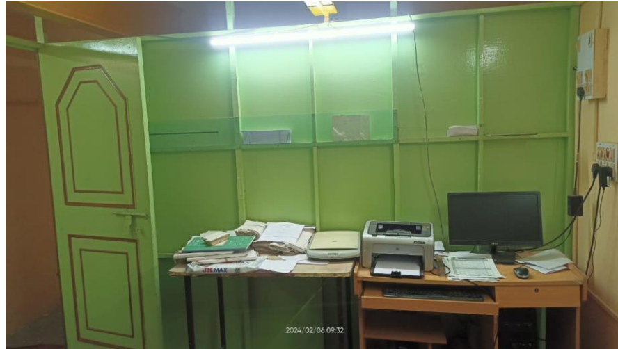
Numerical Laboratory (Mathematics)