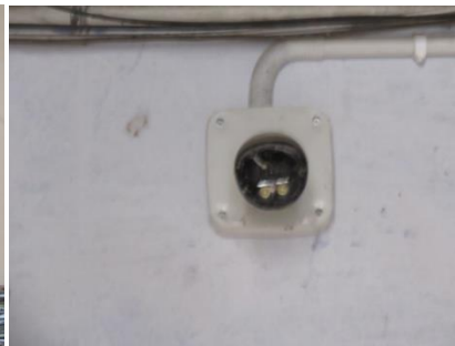
CCTV in Office