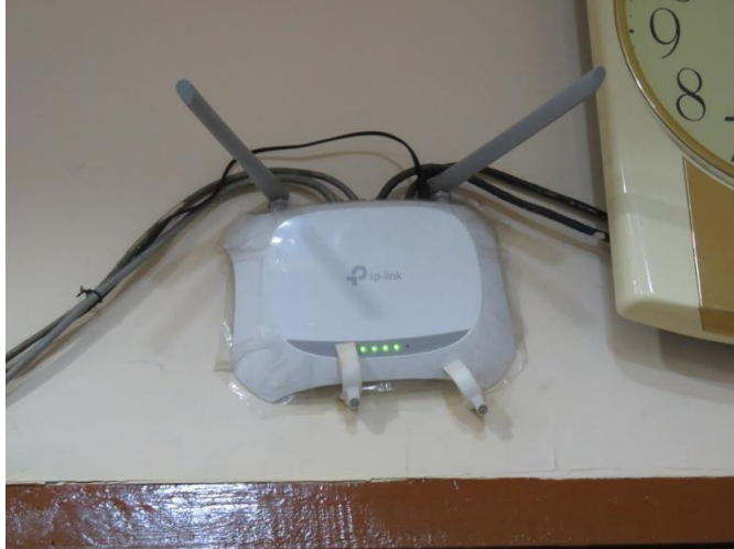
One of 8(Eight) Wi Fi Modem