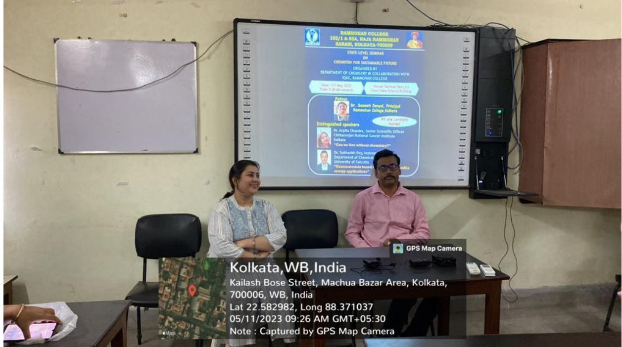
Smart Class Room