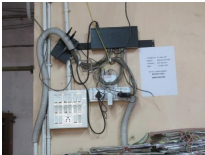
Separate Internet Connection