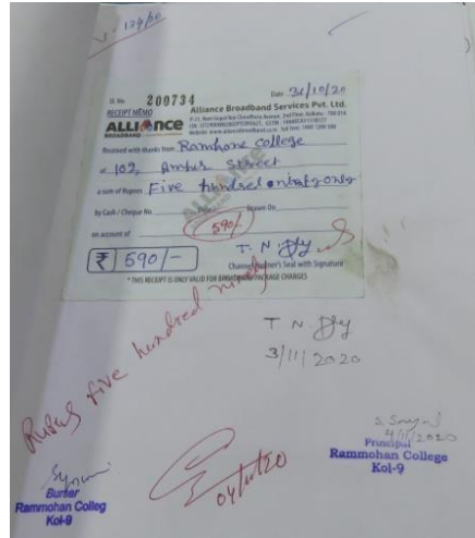
Bill of one Connection