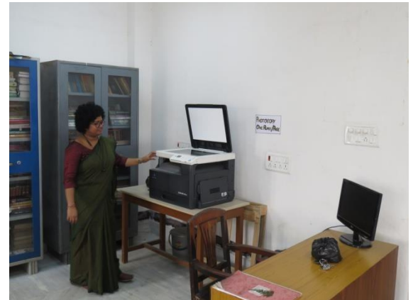
Xerox Facility for Students