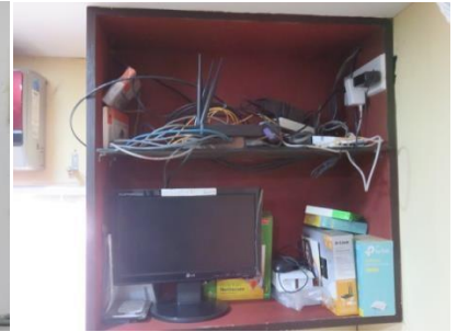
Main Server Computer Entire

Administration has been closely monitored by the Principal, Rammohan College, through CCTV surveillance system