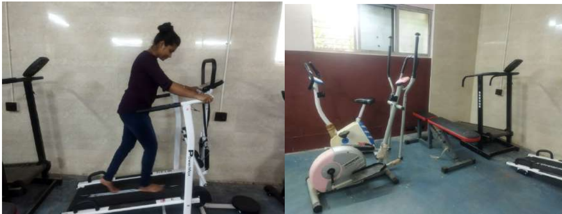
Equipments available in the College Gymnasium